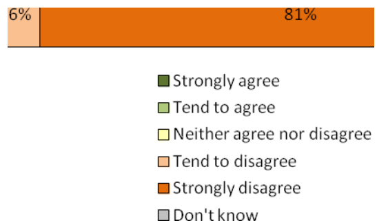
Chart 2 - It is proposed that the county council applies a formulaic increase to future years' concessionary charge that is on the basis of the Retail Price Index (RPI) plus 5%. How strongly do you agree or disagree with this proposal?

Respondents were asked how strongly they agree or disagree with this proposal. Four-fifths of respondents strongly disagree (81%) with this proposal.